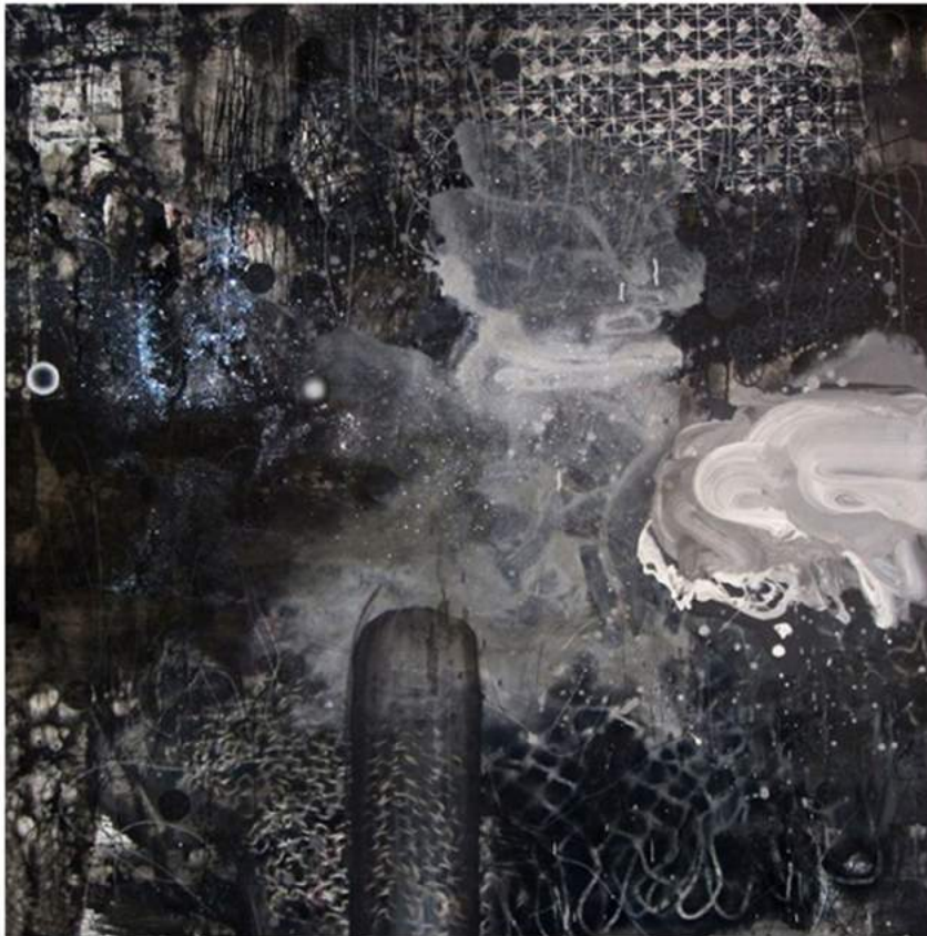
David Huffman – Darklogic 2015 Acrylic, oil, spray paint, glitter, graphite, printing ink on wood panel

Huffman's paintings seem to be a meeting point for abstraction and a form of symbolic figuration, leaving just the right amount of space needed for the metaphorical to arise. That said, it can be easily recognized that basketball serves as a metaphor for all the possible difficulties and victories related to the black social uplift , and it is also a symbol for dreams of wealth, fame and acceptance. However, this subject is brought up in a sophisticated, delicate manner, and although the motive reappears in many different versions and numerous times in each of these paintings, its presence is not as apparent without a proper introduction.