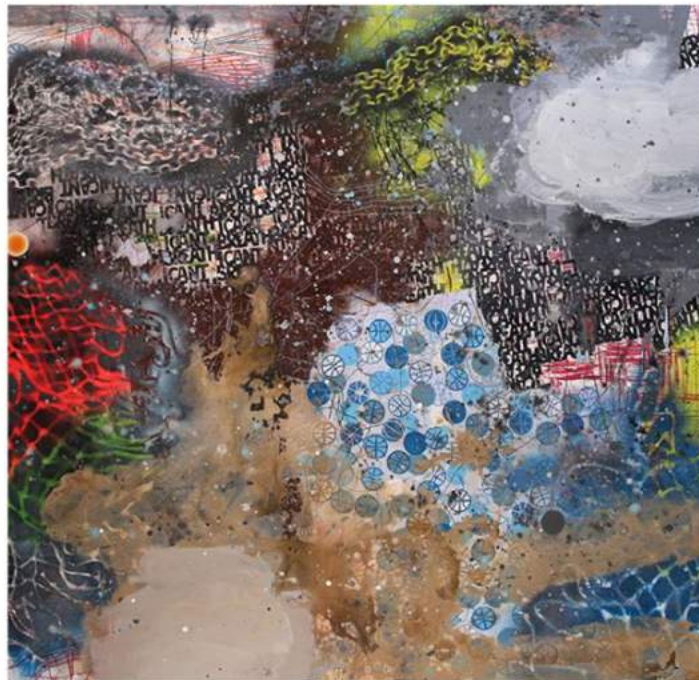
David Huffman – I Can't Breathe 3, 2015 Acrylic, oil, spray paint, glitter, color pencil, printing ink on wood panel

California-based artist David Huffman gained recognition as a supporter of the moderately controversial, yet subtly delivered subjects in art. His art is engaged in cultural acuity and focused on social diversity, one that is made apparent through the imbalanced state of the world. The upcoming exhibition follows Huffman's special treatment of a very specific subject matter – the iconography of a basketball, which tacitly signifies the politics of race, addressing the African Diaspora and those who are usually associated with “handling” the basketball. This unusual motive is reinterpreted in many ways, over and over again, throughout the entire series. The replicas of the basketball are intertwined with other motifs, and most of them could be rendered as abstract alternatives to the basketball itself.